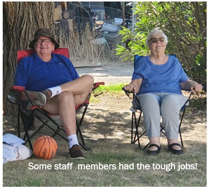
Some staff members had the tough jobs!