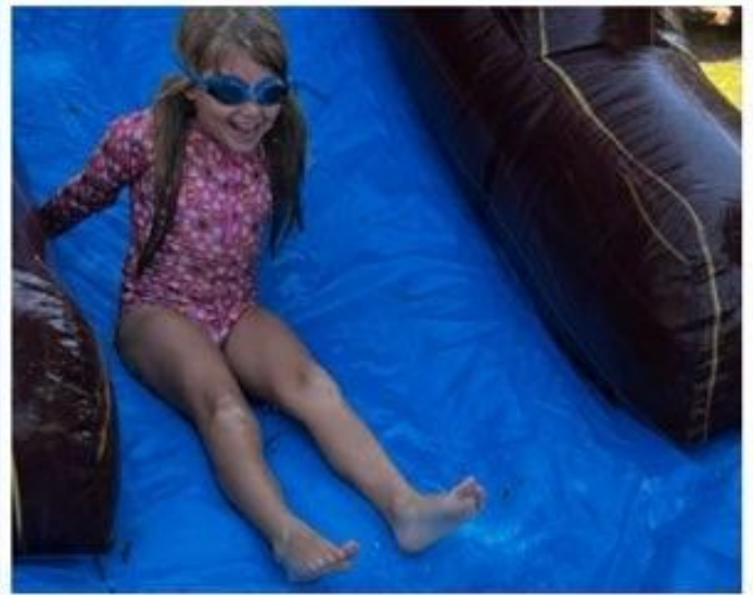
Last day fun in the sun!