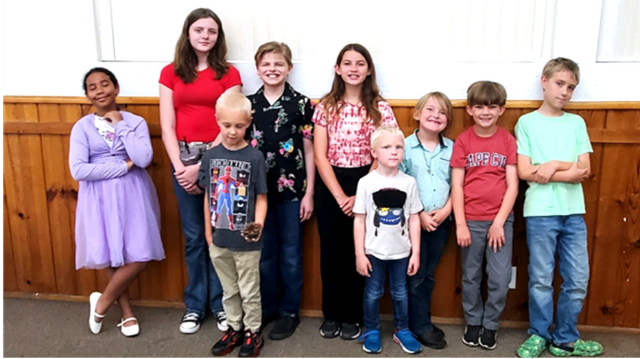
Sunday School students from left”

This schedule does not reflect changes or additions made after May 26th,